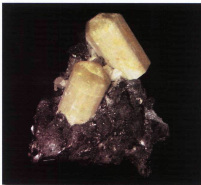
Figure 1. Apatite and magnetite (gangue and ore respectively) from the Dashkesan (Dashkezan) Co-Fe deposit, Dashkesan, Rayonu, Azerbaijan. Specimen measures 7 x 5.5 cm.