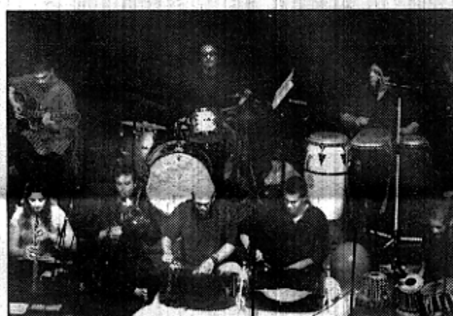
MU Global Rhythms in performance